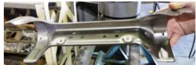
Seat Components and Assembly