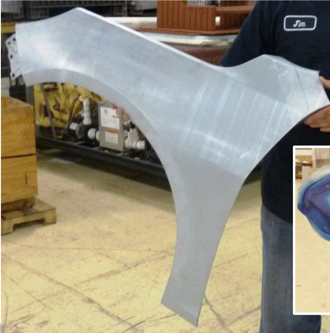
Buick Fender: Before and after 5 axis Laser