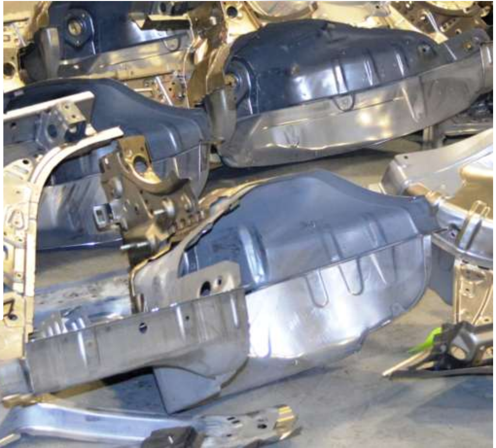
Wheel Housing Components and Complete Assembly