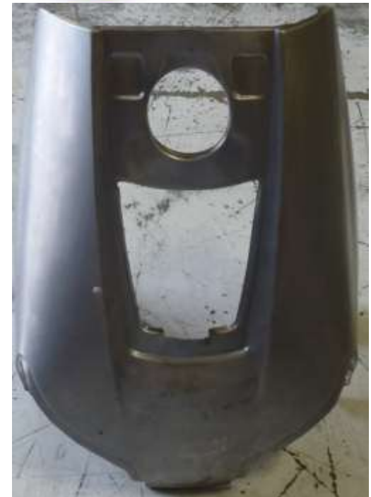
Riding Mower Engine Hood