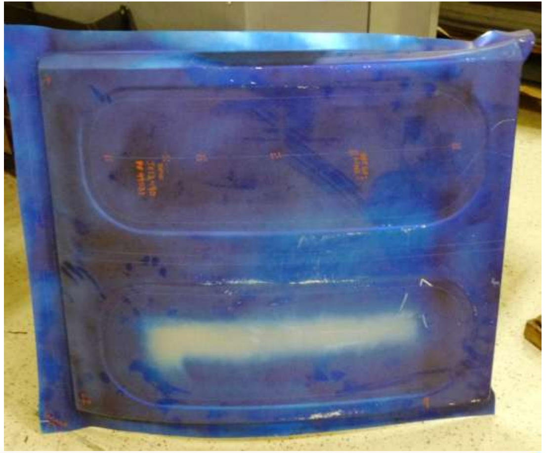
Inner / Outer Gunner Doors Apache Helicopter