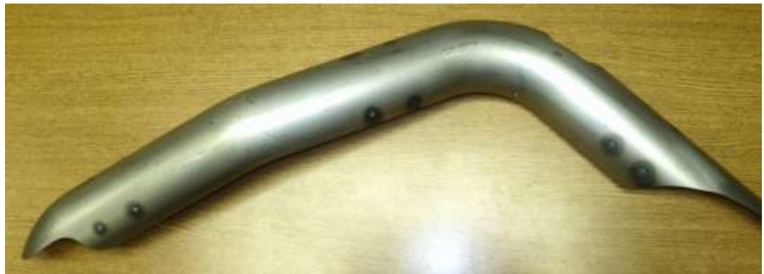
.02 Aluminum Heat Shield (L), Motorcycle Exhaust Shield (R)