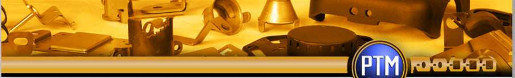
Casket Head and Foot With Bulk Head Assembly