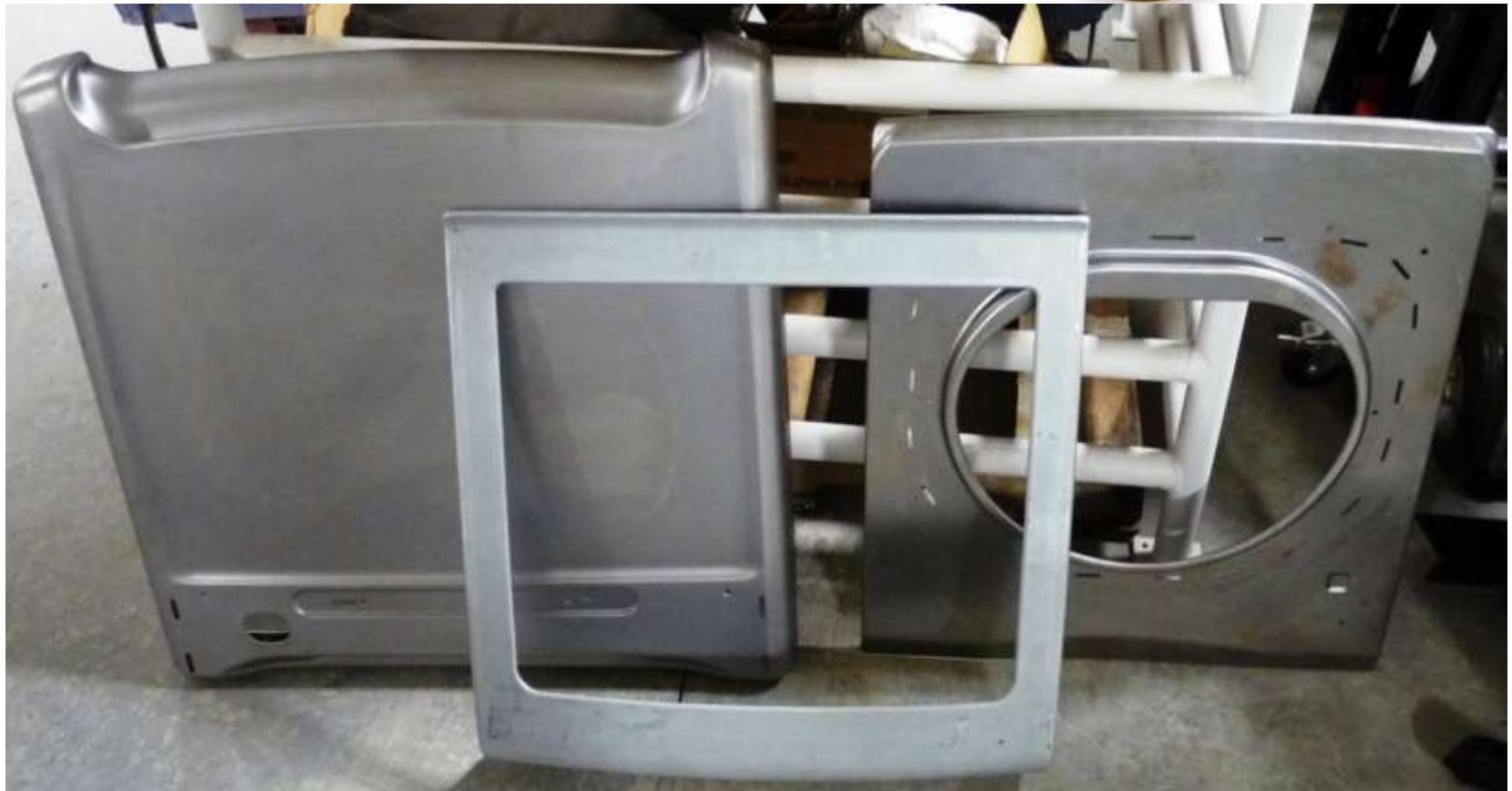
Washer and Dryer Panels